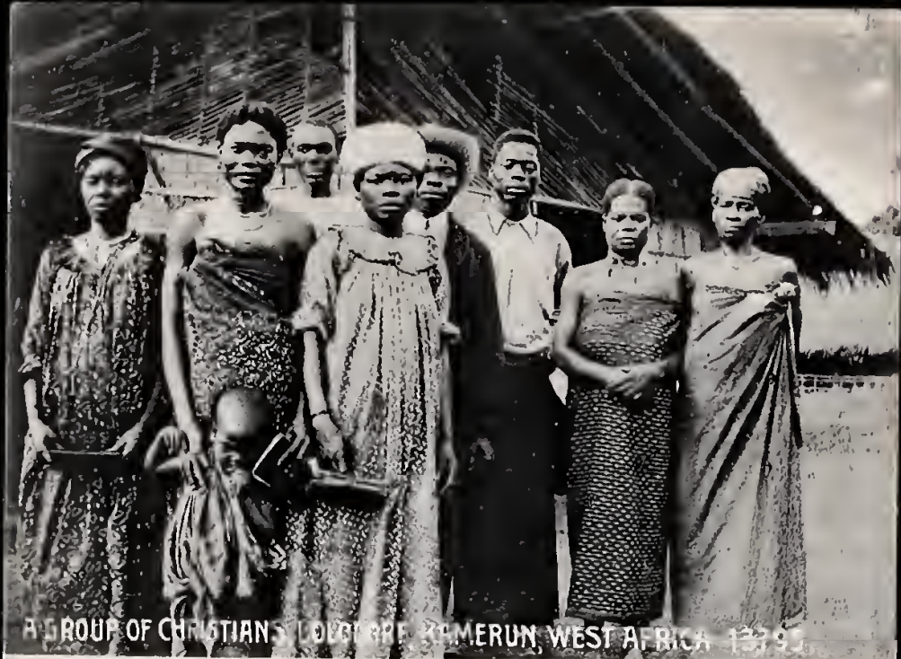
A GROUP OF CHRISTIANS, LOGBARRÉ, CAMERUN, WEST AFRICA 1925